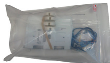
Individual point of sale packaging available for stocking distributors