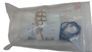
Individual point of sale packaging available for stocking distributors